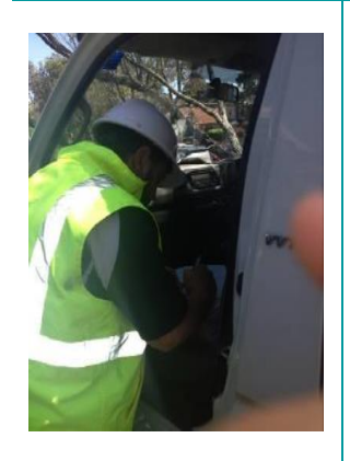
Checking and signing documentation